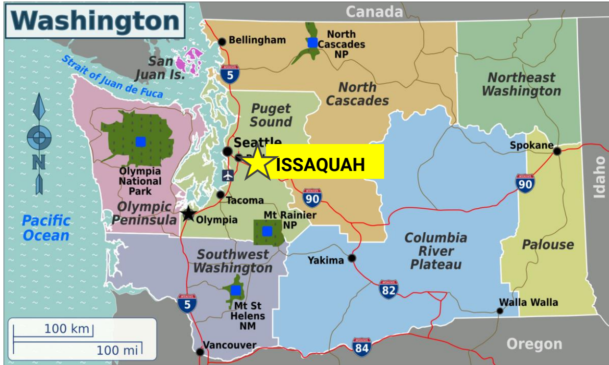
[Image description: A map of the State of Washington. Issaquah is located near Bellevue, Washington right by the freeway I-90. Issaquah is labeled with a yellow star and written in black with a yellow border. ”]