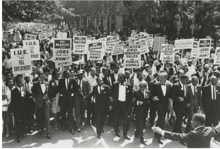
[Image description: A black and white photograph of a huge crowd of people, mainly Black men and women in dress clothes marching together holding many different signs. Some of the signs say, "We march for jobs for all NOW!" "We demand voting rights NOW!" and "End segregated rules in public schools."]