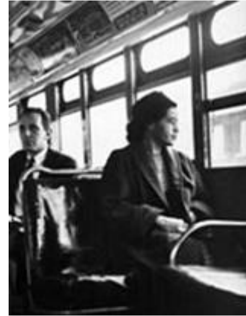
[Image description: A black and white photograph of Rosa Parks, a Black woman sitting on a bus. She wears a hat and coat and looks out the bus window. A white man in a suit sits behind her.]